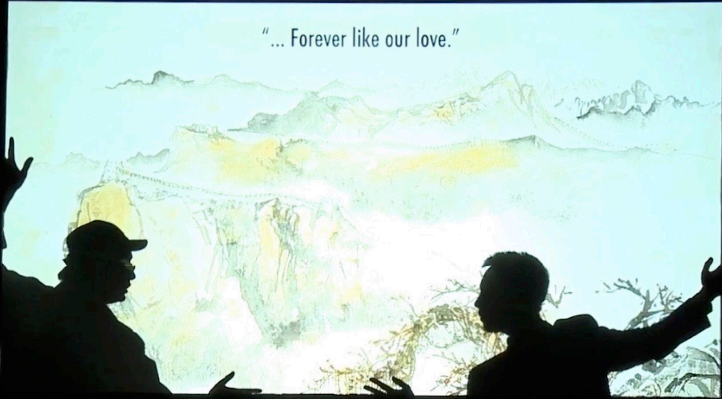
"Chinglish" by David Henry Hwang