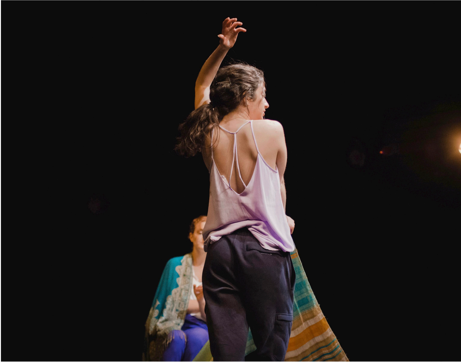
"Sotto Voce" by Nilo Cruz