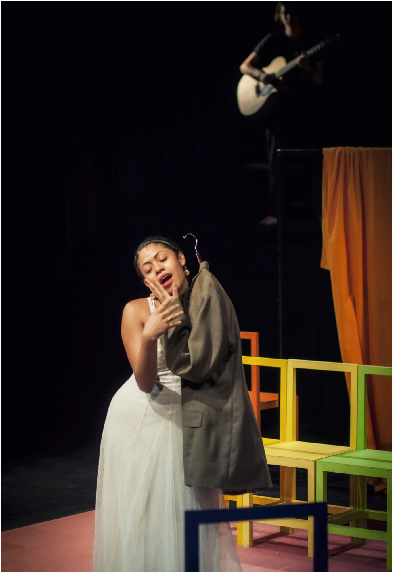
"El Traje" based on the original staging by Peter Brook, adapted from Can Themba's "The Suit"