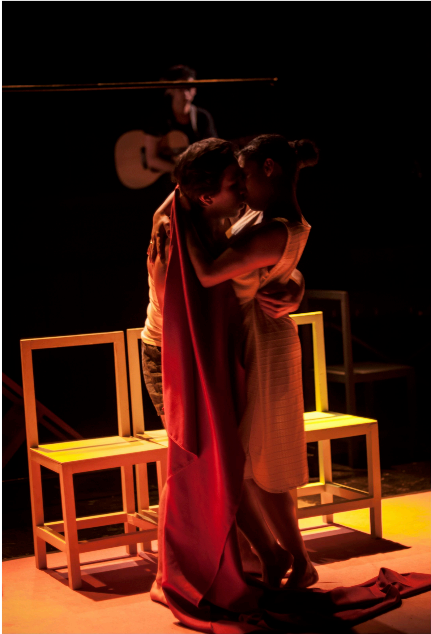
"El Traje" based on the original staging by Peter Brook, adapted from Can Themba's "The Suit"