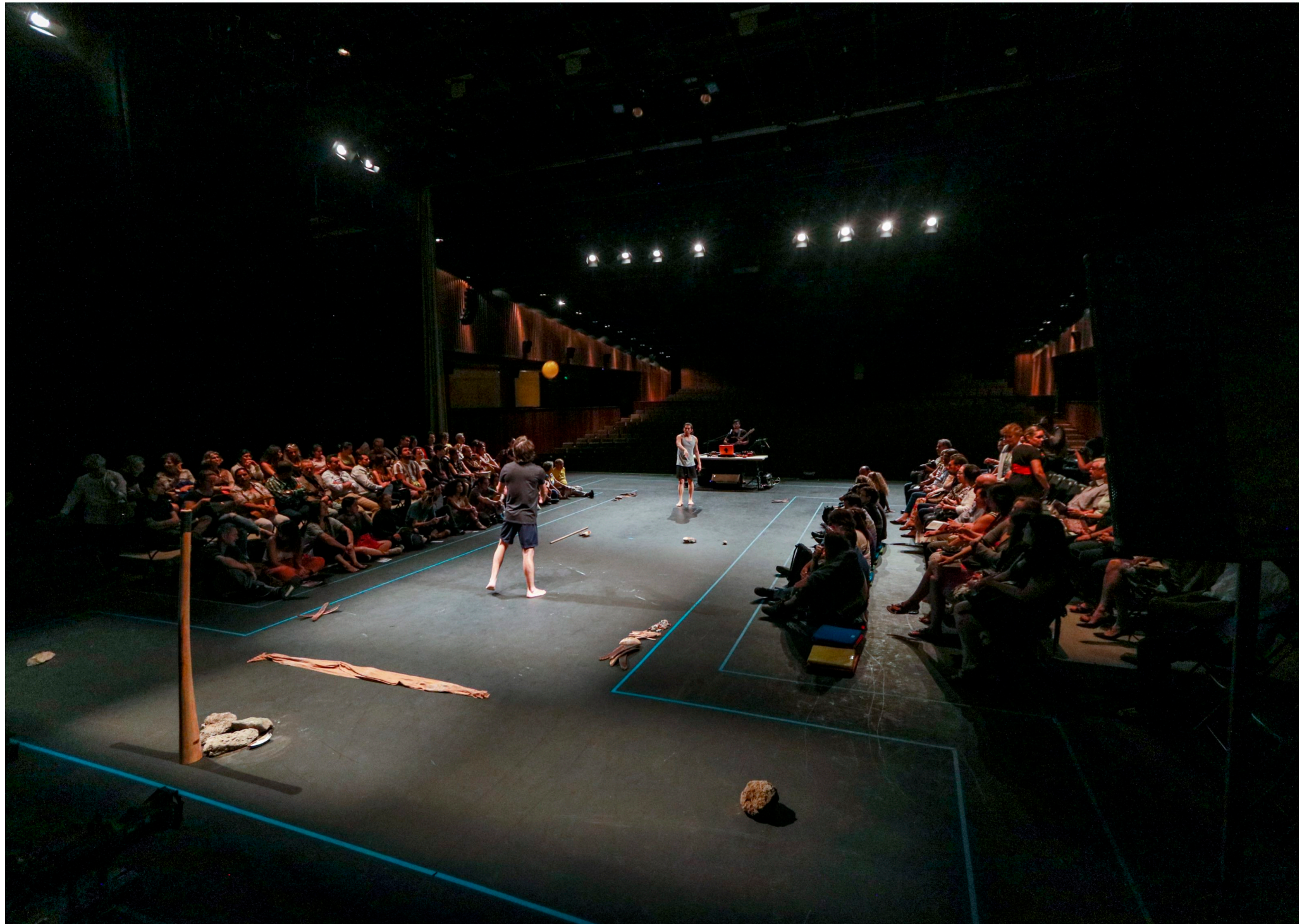
"The Game. o the pernetual rematch" by Héctor Flores Komatsu & Makuveika Colectivo Teatral