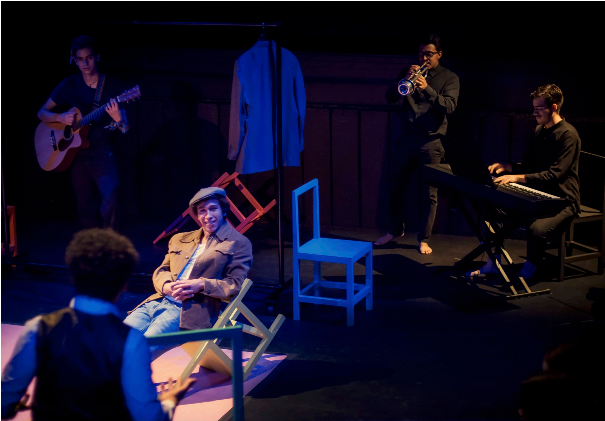
"El Traje" based on the original staging by Peter Brook, adapted from Can Themba's "The Suit"